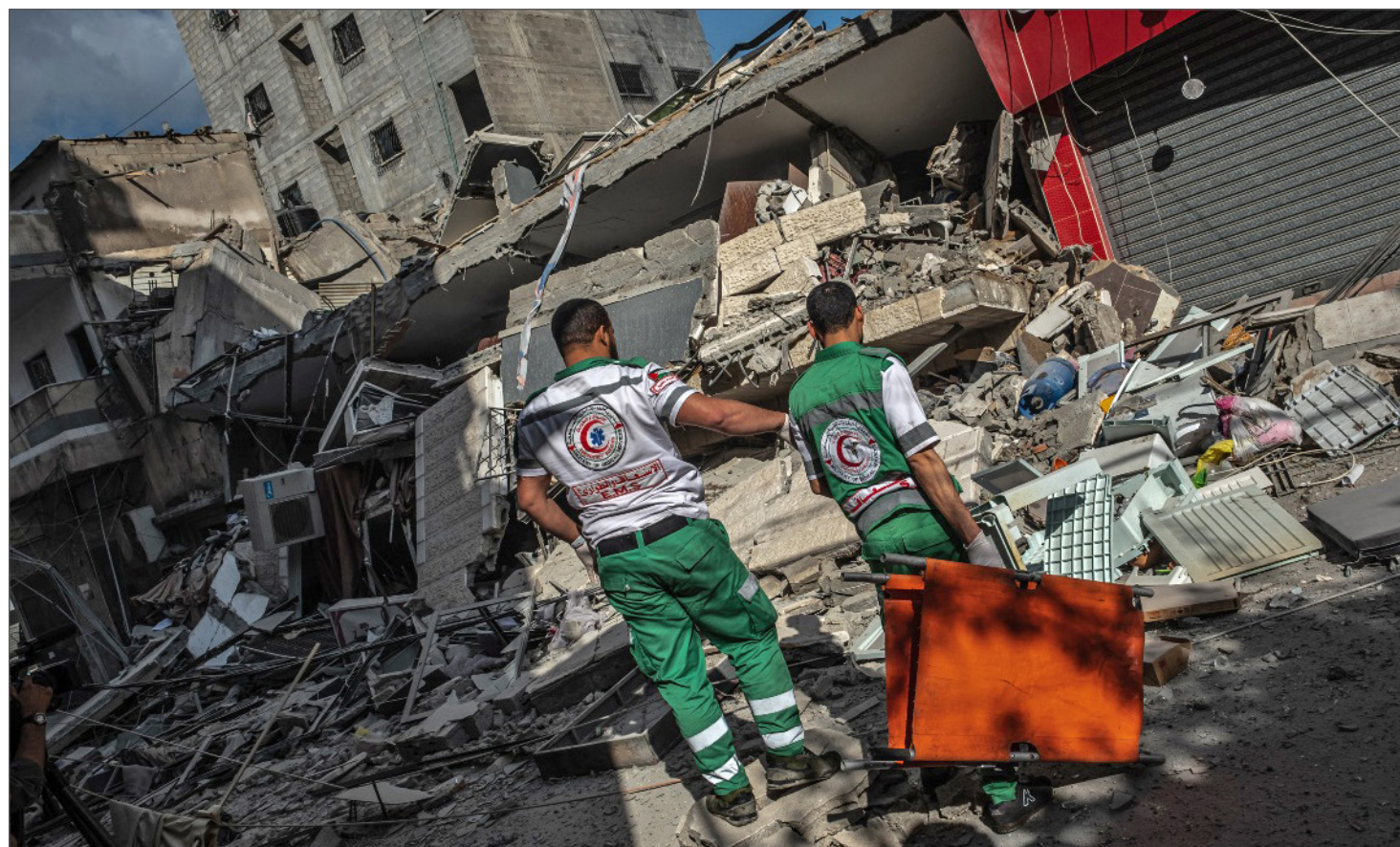
The bombing Aftermath in Gaza

Also, Iran's state media have been busy broadcasting rocket attacks on Israel by Hamas and Islamic Jihad groups, to make believe that they are destroying Israeli. But they do not say anything of the misery and catastrophic situation of Palestinian people, especially in Gaza, and if Palestinian people agree with these rockets attack which resulted in Israeli air strike and shelling that killed so many people!? Of course, the pain of Palestinian does not