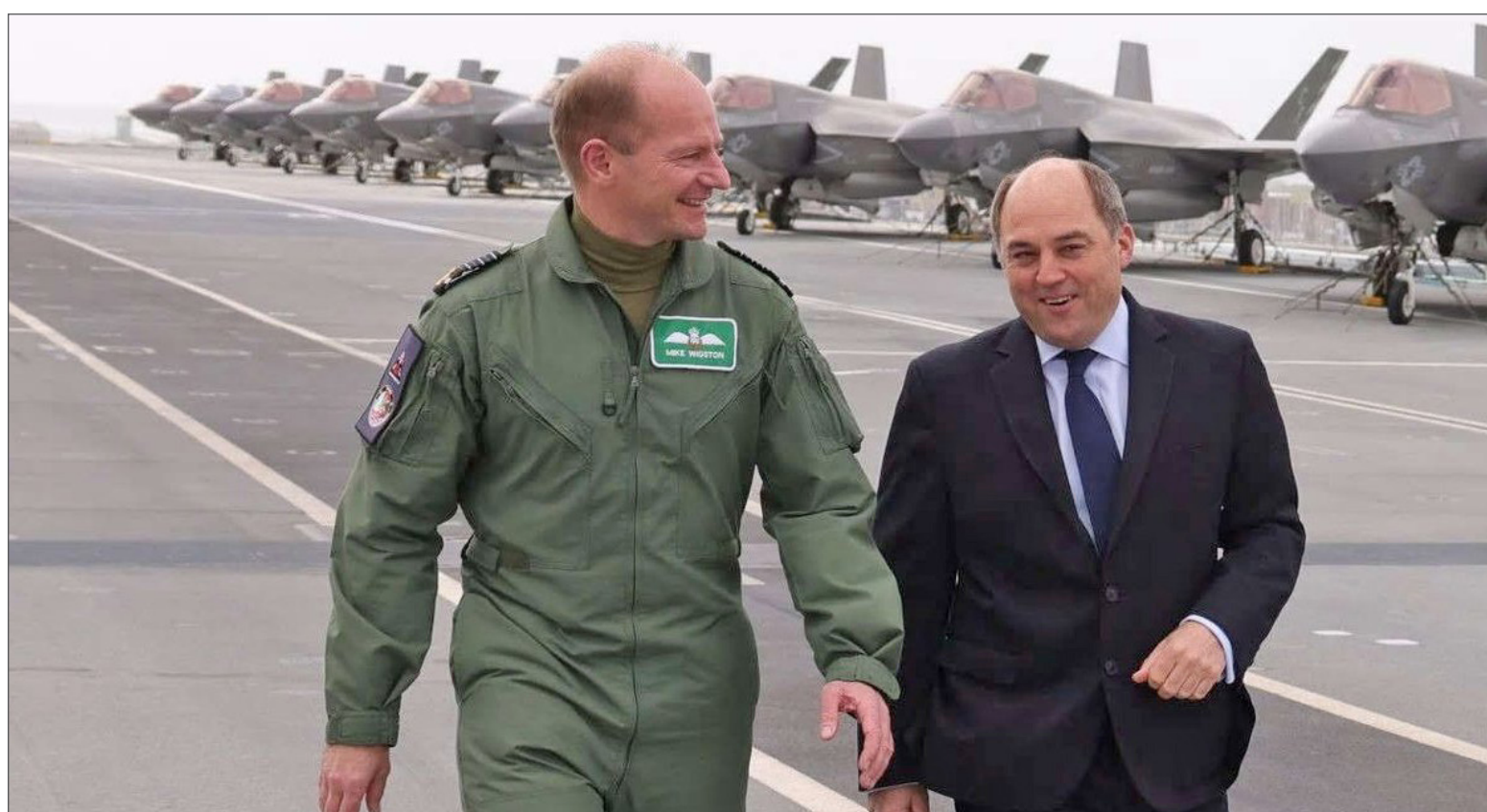
Ben Wallace, right, on the deck of the HMS Queen Elizabeth to mark her departure for a seven-month operation in the Far East

The Defence Secretary has said that Russia's submarines are 'circling Britain's entire coastline' and warned that Putin's force remain our 'number one adversary threat'. 'We're regularly visited by nosy Russian ships, and we are regularly visited now by a number of Russian warships,' he said to Telegraph newspaper, 'we have tried de-escalation, we have tried methods but at the moment until Russia changes its attitude, it's quite hard to see where we're going to go,' he added, 'A Russian kilo-class submarine was spotted in the Irish Sea for the first time in a 'very, very long time' at the end of last year,' he noted.