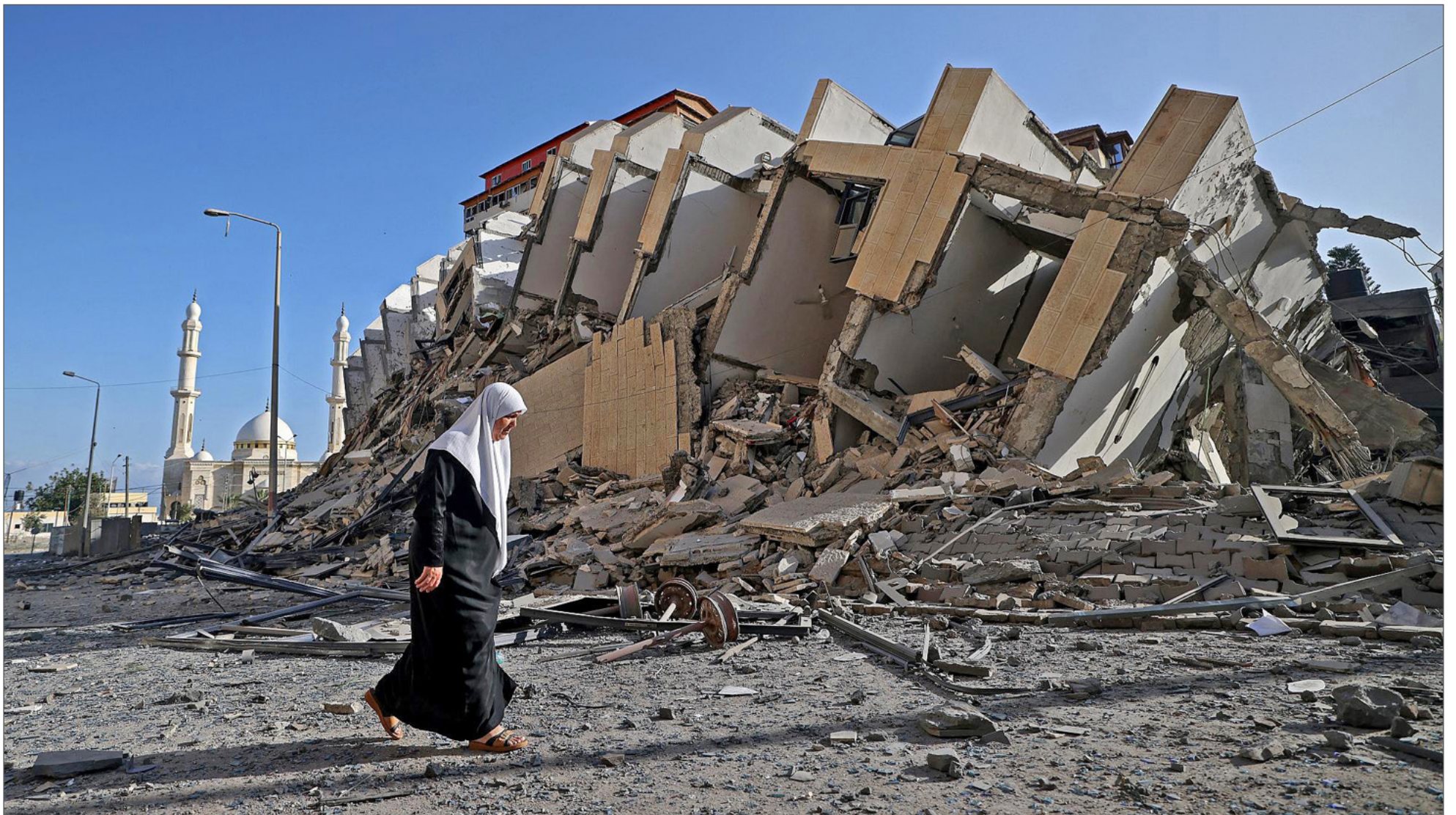
A woman walking among the rubble in Gaza