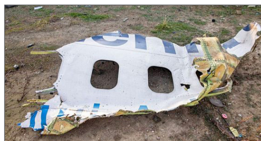
Wreckage from downed Ukraine Int. Airlines Flight 752

in court. As many as 138 of the 176 people killed on the flight had ties to Canada. The Iranian government has said the jet's downing in January 2020, was a "disastrous mistake" by forces who were on high alert during a confrontation with the United States after the commander of the Quds Force Qasem Soleimani was assassinated.