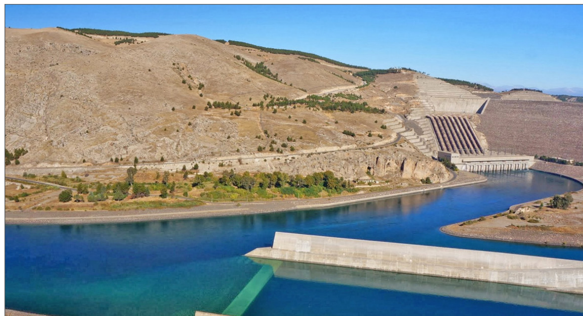
The Euphrates and Tigris River Basin