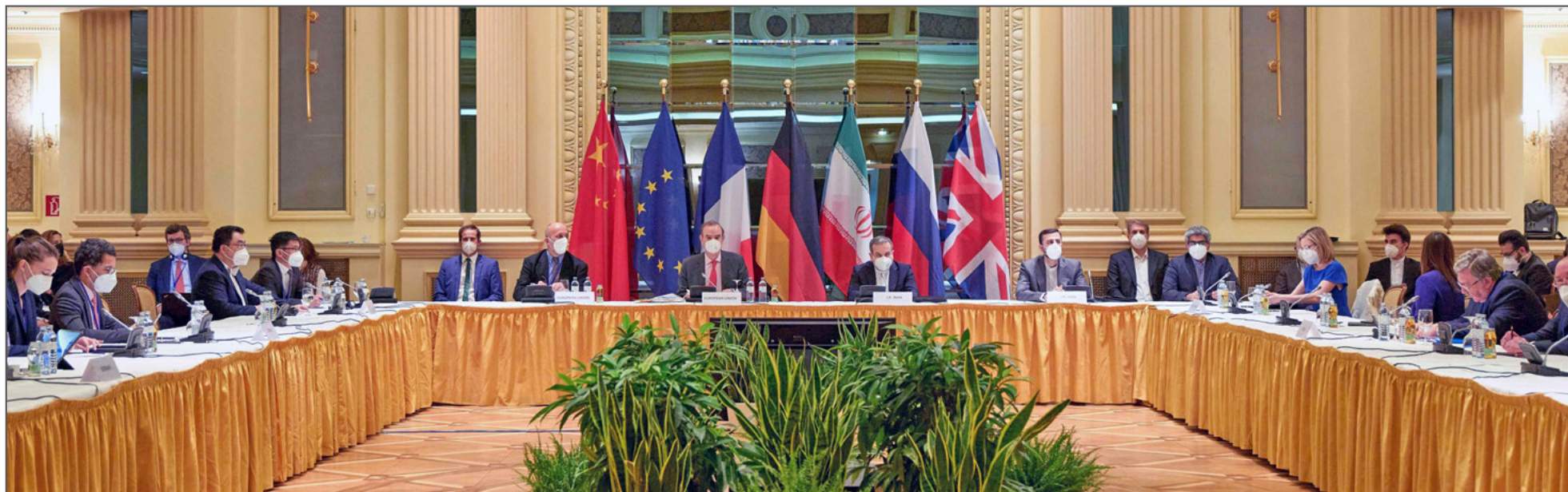
Delegation members from the parties to the Iran nuclear deal

When Joe Biden assumed office on 20 January, everyone thought he would soon return to the Iran nuclear deal, from which Trump withdrew. However, than 4 months have passed, with the negotiations on returning to the JCPOA getting nowhere, which indicates that way is not paved to return to the deal anytime soon as both sides seek to achieve more gains.