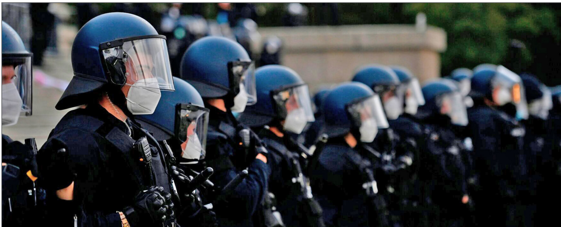
German security forces

Germany has long endured violence from “Jihadist” that s posed growing threat to Germany, and marked a series threats.