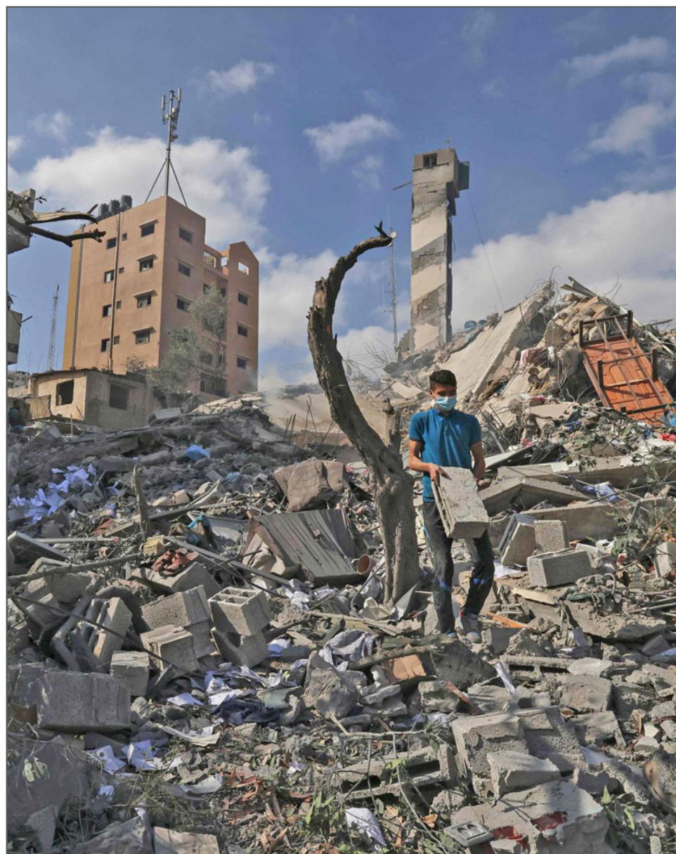
Destruction in Gaza

And of course the latest round has done nothing to ease the blockade of the Gaza Strip – maintained by both