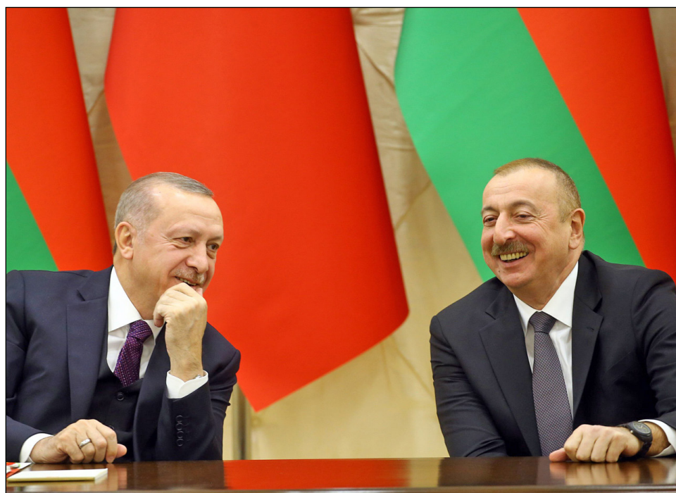
President Recep Tayyip Erdoğan and his Azerbaijani counterpart Ilham Aliyev