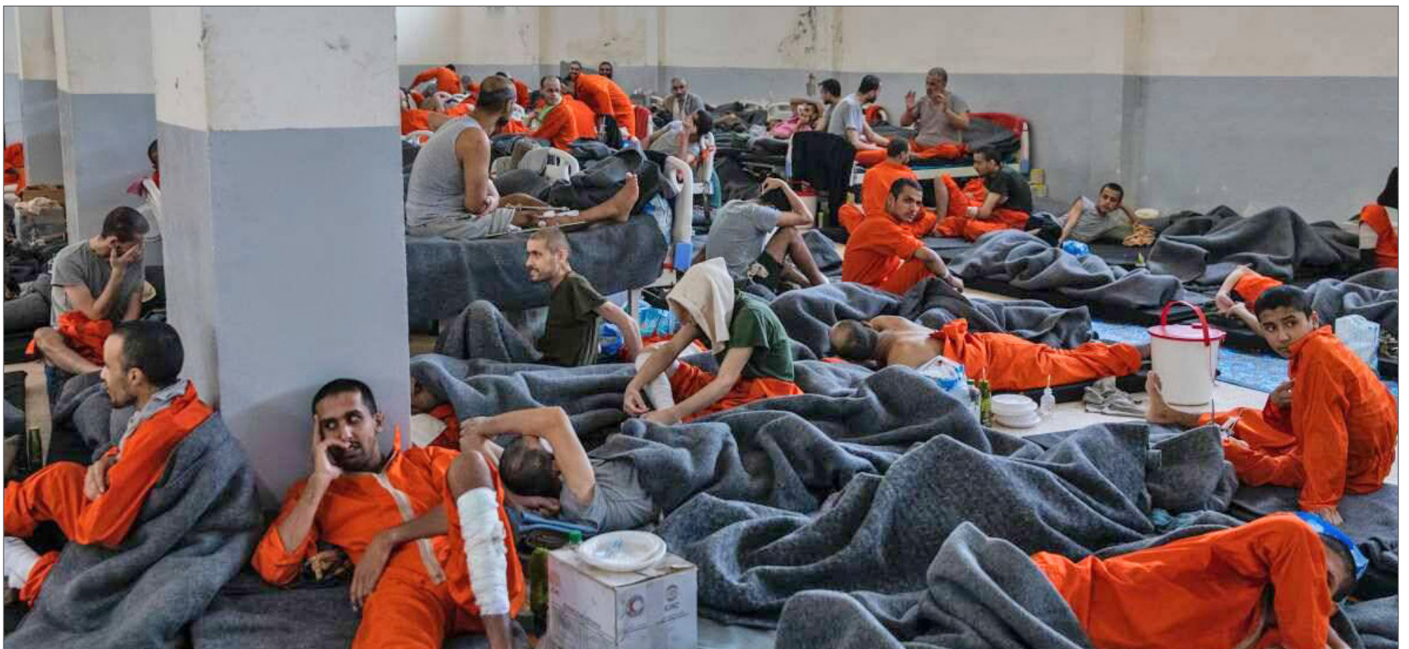
Islamic State fighters at a makeshift prison in Hasaka, Syria

SDF losses in this period of action have not been light and the damage to the physical prison infrastructure appears extensive. All this points to the need of the US-led Coalition to review not only the capabilities of ISIS but more importantly what their plans are to counter them better. Prisons will need to be rebuilt and improved, SDF forces replenished and trained but ultimately the question as to the long-term future of these detainees and their families has to be better grasped and owned. Considering how the prisons act as a rallying point and strategic objectives for ISIS there is an even stronger argument than before to disperse many of the fighters back to the fifty of so countries they're originally from in order to face justice. The tension in Ukraine, however, is currently dominating the world's bandwidth making even the resurgence of ISIS a sidebar story.