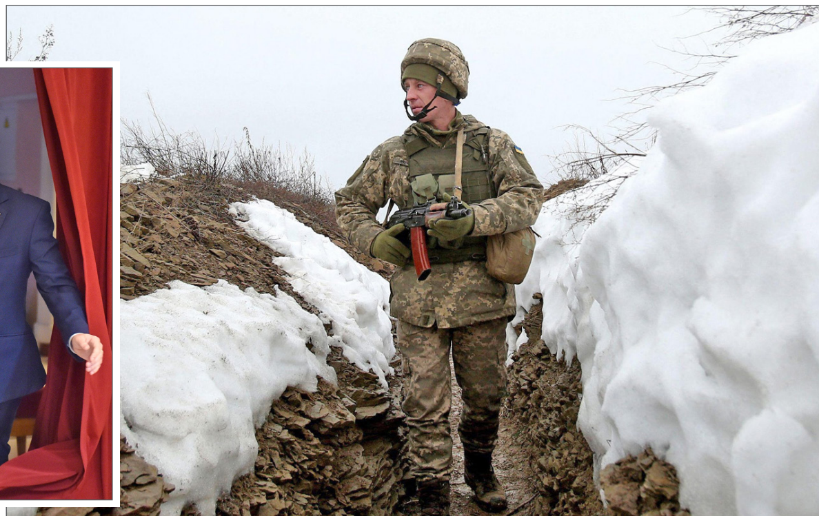
A Ukrainian soldier walks through a trench on the frontline with Russia-backed separatists